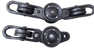
150 type UH-5075-S