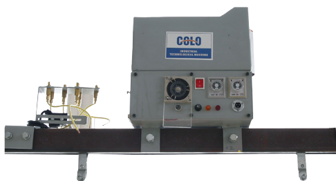
Auto Lubricator for conveyor chain system