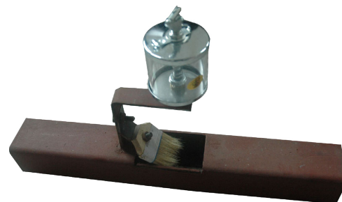
Manual oil cup