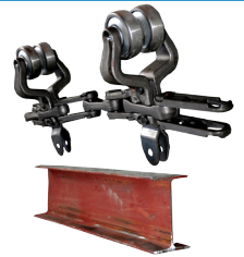
458 type with trolley